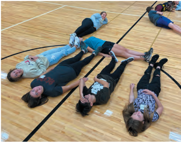
Middle School WEB