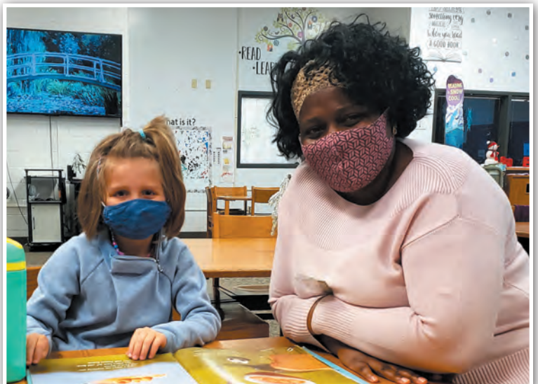
Power Lunch Program