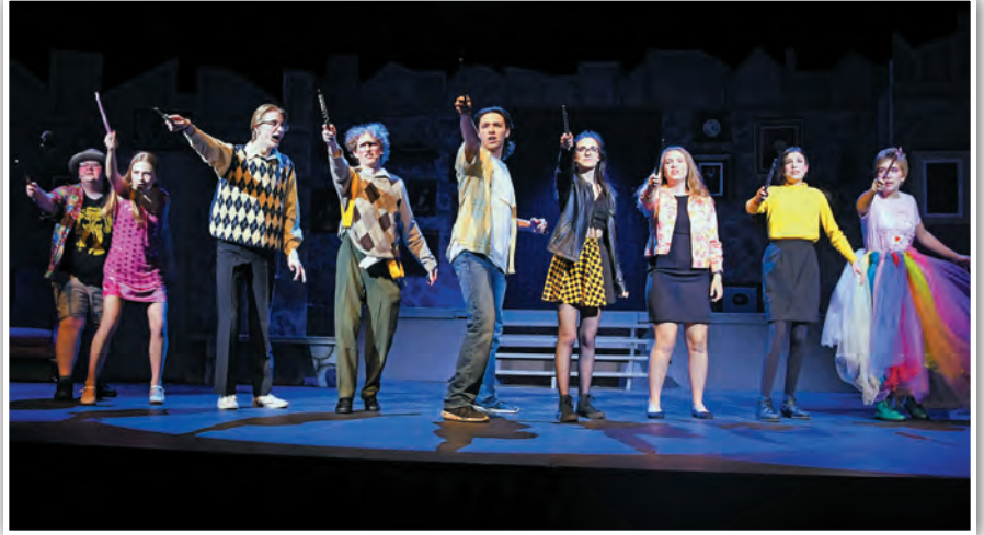
CHS Spring Play, "Puffs"