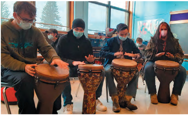
Expanded CAAEP Drum Ensemble