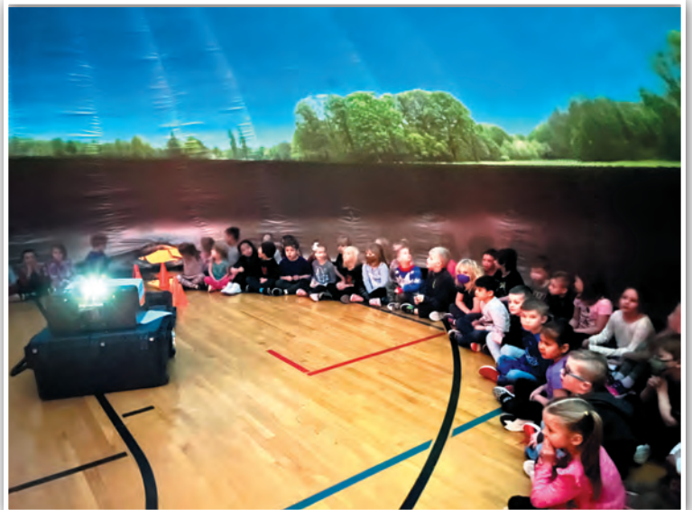
Washington Elementary "Skydome Planetarium"