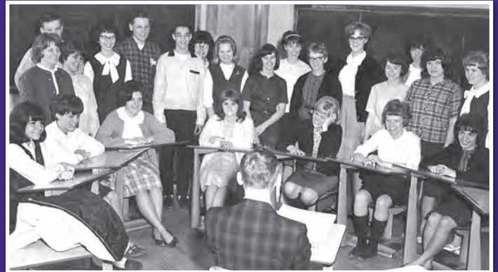
Spanish Class 1965