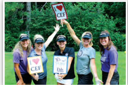
Cloquet teachers having fun on the links in support of CEF.