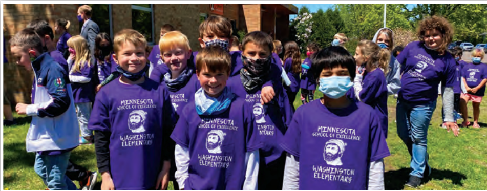
Washington students enjoy a great day celebrating their hard work.